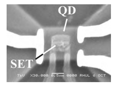
Fig.1 SEM picture of the QD detector. QD is formed by pinch-off of a mesa channel.