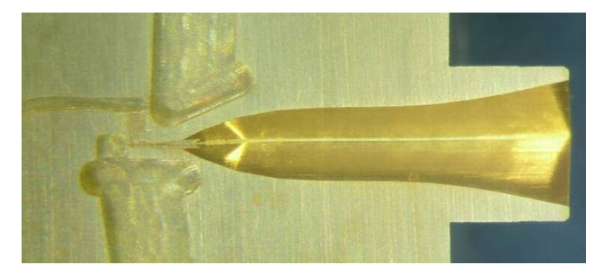
Fig. 2 1.2THz Sub-harmonic mixer split-block including spline diagonal horn antenna (design by GMD, machined by RPG Radiometer Physics GmbH)

The diagonal horn using the Whyborn [5] directtransition from waveguide to horn suffers from poor match at extreme low frequencies (bottom end of a complete waveguide band). Good performance can be regained using a slightly modified flared-waveguide transition to the horn. More details are given in [9].