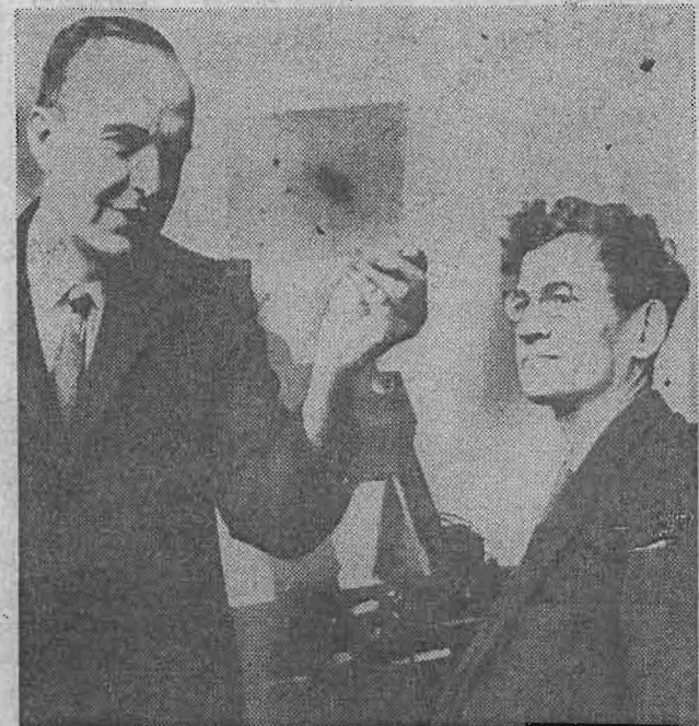
STUDYING telescopic picture of galaxy are Drs. Allan Sandage and Phillip Veron of Palomar.

The steady-state universe is an expanding universe just as the big-bang universe is. But it will never thin out, for as the galaxies drift apart, new matter (probably hydrogen) is formed between the galaxies. In time, enough of this matter comes into be-