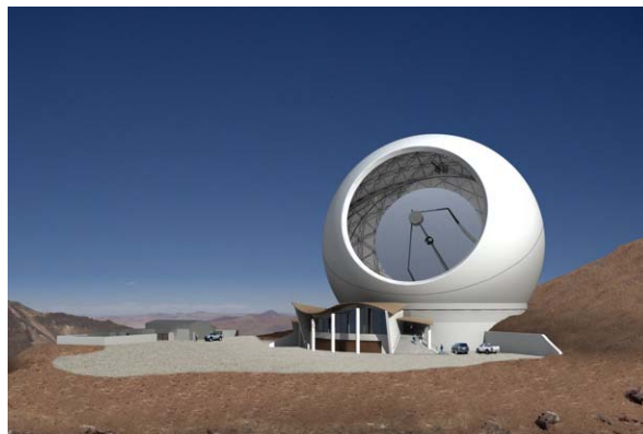
Fig. 1. CCAT at 5600 m on Cerro Chajnantor, Chile (concept view).