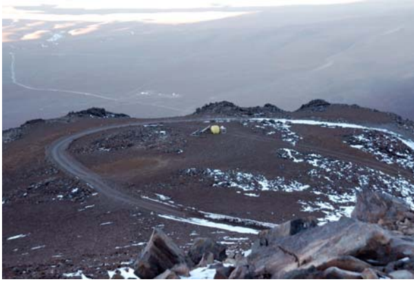
Fig. 2. View to the northeast over the CCAT site and meteorological equipment at 5612 m near the summit of Cerro Chajnantor. The existing ASTE and NANTEN2 telescopes are visible on the plateau 800 m below.