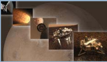
Figure 1 : NASA Montage of sequence of events of EDL.